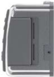
CFV II digital capture unit